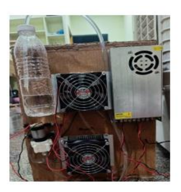
Fig 3. Rear View