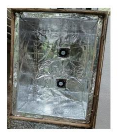
Fig 2. Front View