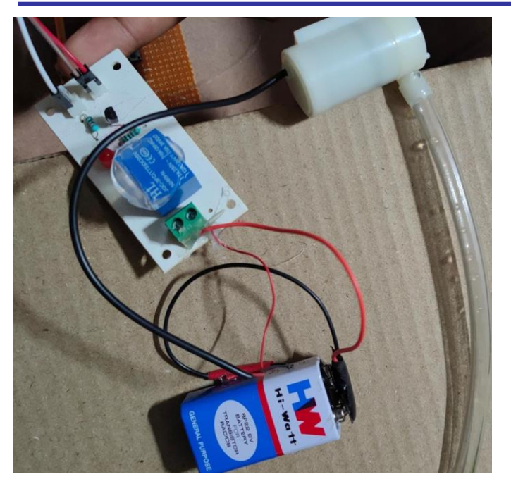
Fig 3. Sanitization circuit